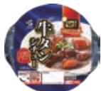
Beef Tongue Stew

This line of products comes in a microwave-safe container, eliminating the need for pods or dishes. The dishes can be served just by heating them in the microwave.