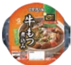
Kotetchan Beef Motsu Stew