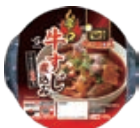
Stringy Beef Hot Stew