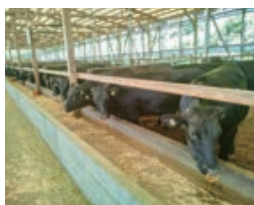
An exclusive farm for S Foods

In the meat processing and wholesale businesses, we implemented measures to strengthen purchasing power for material both domestically and globally. Our primary concern for business development has been placed on building-up of ever-lasting business