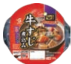
Stringy Beef Stew