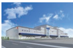
New Tokyo branch

and service through upgrading the knowledge and skill of our employees. In the meat foodservice business, we implemented measures for improving competitiveness such as creating new menus and reforming unprofitable stores at the steak restaurant chain company and the barbecue and shabu-shabu restaurant chain company.